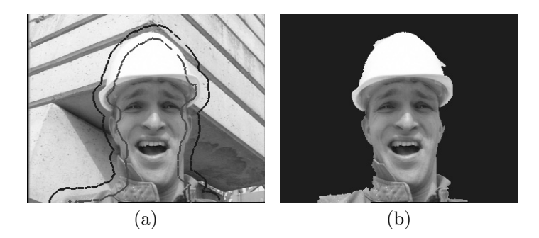
Figure 4. Heuristic comparison applied to the Foreman sequence. (a) Binding of markers. (b) Segmentation result.