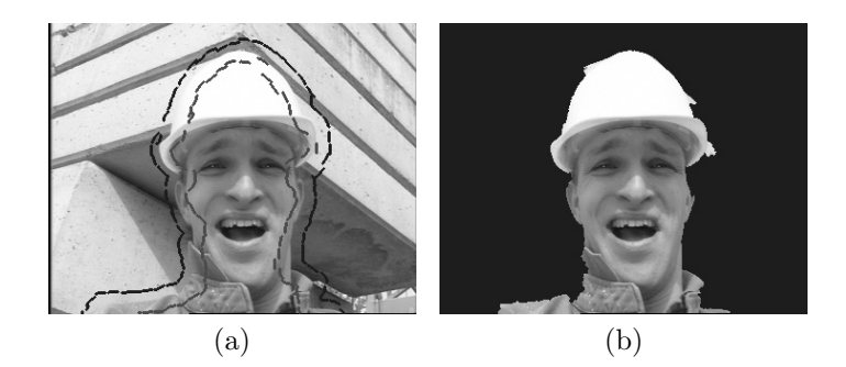
Figure 3. Heuristic comparison applied to the Foreman sequence. (a) No heuristic. (b) Segmentation result.