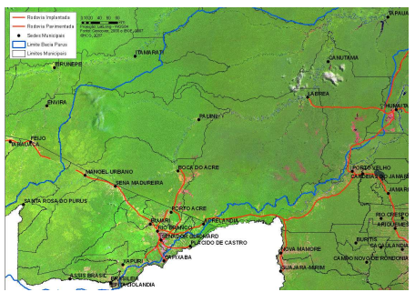
Figure 3: Roads that cross the upper and middle Purus.

The opposite occurs in all municipalities of Alto Purus, which have smaller territorial extensions and are cut by federal and state highways. This setting changes the pattern of spread of disease, because the data show the occurrence of low numbers of autochthonous cases and indicate there has been more reporting of cases imported from other counties [2]. In this region of the basin lies the capital of Acre, Rio Branco, from where it gives the intersection of federal and state highway linking it with the interior (Figure 3).