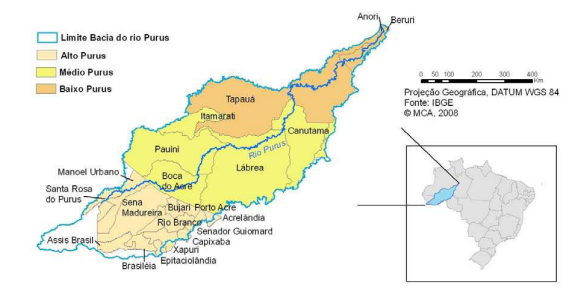
Figure 1: Location of the study area. Purus River basin, Amazon, Brazil.

Approximately 99.8% of malaria cases around the country are registered in the region, with an average of 500,000 cases annually [2]. And among them, the states of Acre and Amazonas, which is located in the Purus River basin (Figure 1), has been presenting since 2005 the largest Annual Parasitic Index (API) [2].