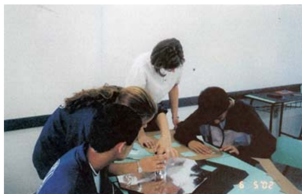
Fig.1 - Students preparing models for exhibition.

In August the schools have presented the project results through a report and science exhibition in INPE Campus. In this exposition some schools presented satellite models, maps about natural resources studies, CD ROM, WEB pages, theater plays, dances, organized and develop by the students. This exposition was open to INPE and São José dos Campos Community.