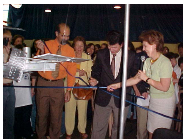
Fig. 2 – Exhibition opening.