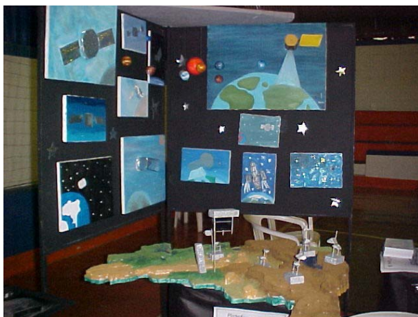
Fig. 6 – Model on the SCD and Remote Sensing Satellite developed by students of Colegio Joseense .