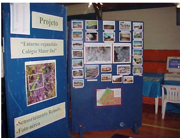
Fig.5 – Remote Sensing Project in the South Area of São José dos Campos developed by students of Colégio Mater Dei .