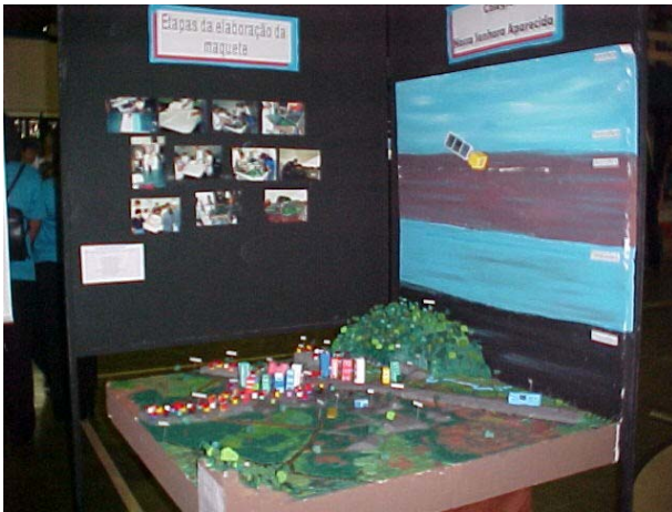
Fig. 4 - Model on Remote Sensing Application developed by students of Colegio Nossa Senhora Aparecida .