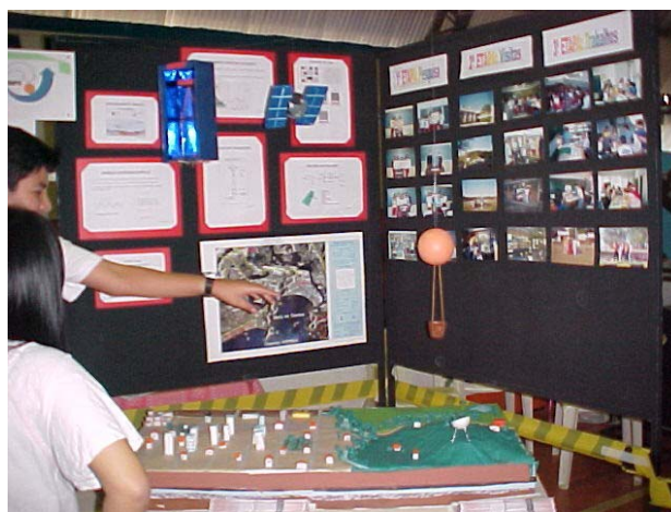
Fig. 3 - Model on Remote Sensing Application developed by students.