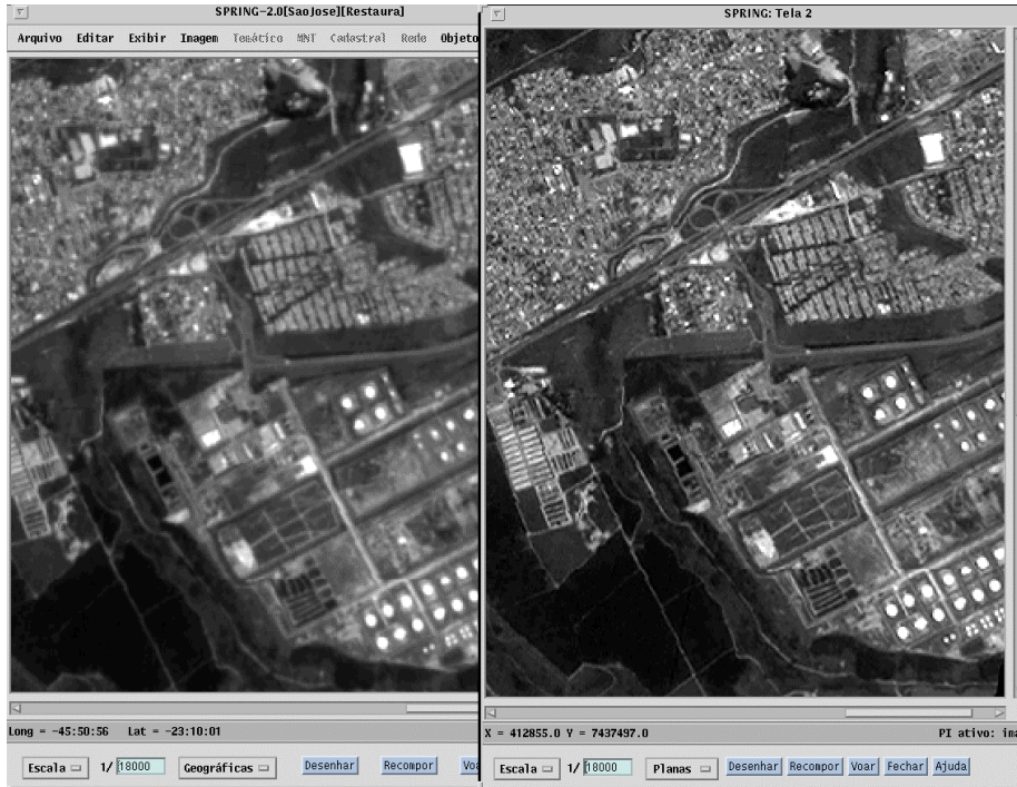
Unrestored 10m resolution image. Right: image after restoration algorithm.

The objective of image restoration techniques is to correct distortions introduced by the sensor during the process of image acquisition. Restoration techniques aim at correcting the blurring effect caused by the sensor's optical and electronic systems. In SPRING-2.0, filters which restore TM and SPOT images are available (Fonseca et al., 1993). The result of the image restoration operation can be observed in Figure 1.