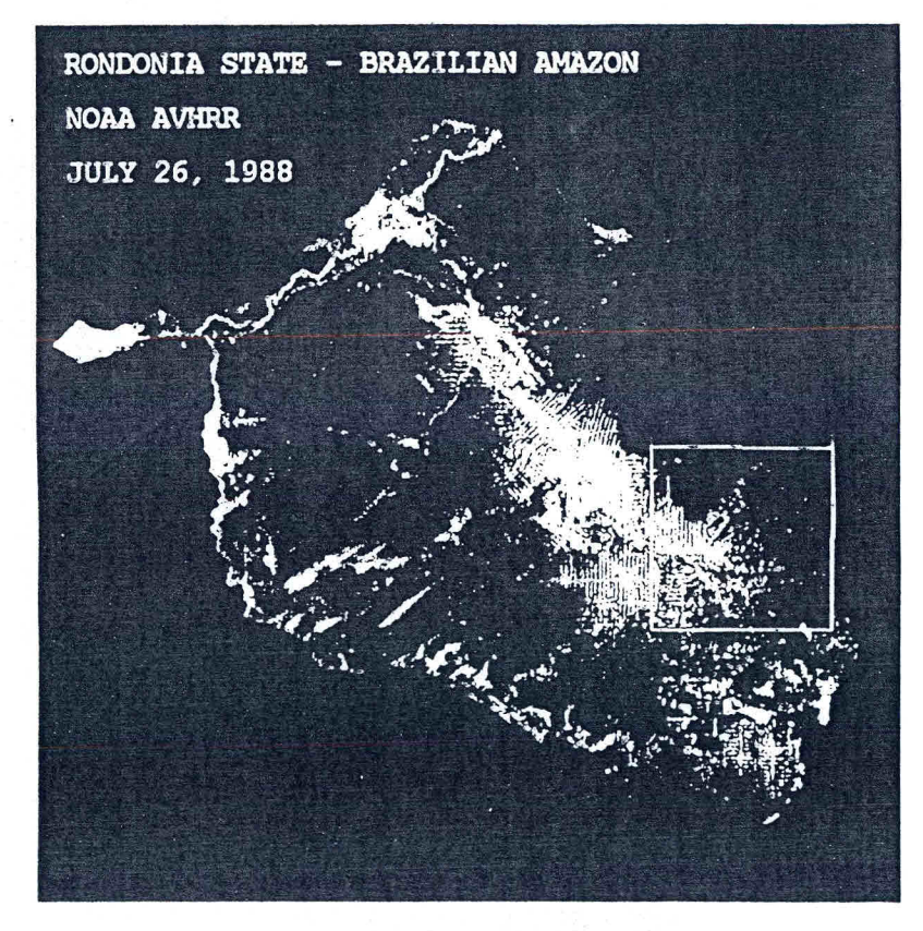
Figure 1. Colour composite of fraction images (Vegetation = Red. Soil = Green, and Shade = Blue) for NOAA AVHRR data acquired on 26 July 1988 over Rondonia State located in the Brazilian Amazon.

Instituto Nacional de Pesquisas Espaciais (INPE). Brazil Universities Space Research Association/NASA-GSFC, Code 923 NASA-GSFC, Code 923. Greenbelt, Maryland, 20771, USA