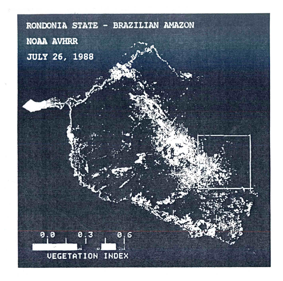
Figure 2. The NDVI image derived from NOAA AVHRR data acquired on 26 July 1988 over Rondonia State.

Fraction images derived from National Oceanic and Atmospheric Administration's (NOAA) Advanced Very High Resolution Radiometer (AVHRR) images contain useful information for studying tropical deforestation. Vegetation, soil and shade fraction images are formed by the proportion amount of each component within the pixel. These values are estimated using the two reflective channels (0.58-0.68 µm and 0.725-1.1 µm) and the reflective component of the 3.55-3.95 µm channel (Kaufman and Nakajima 1993, Kaufman and Remer 1993). The endmembers for AVHRR image to run the Constrained Least Squares (CLS) Method