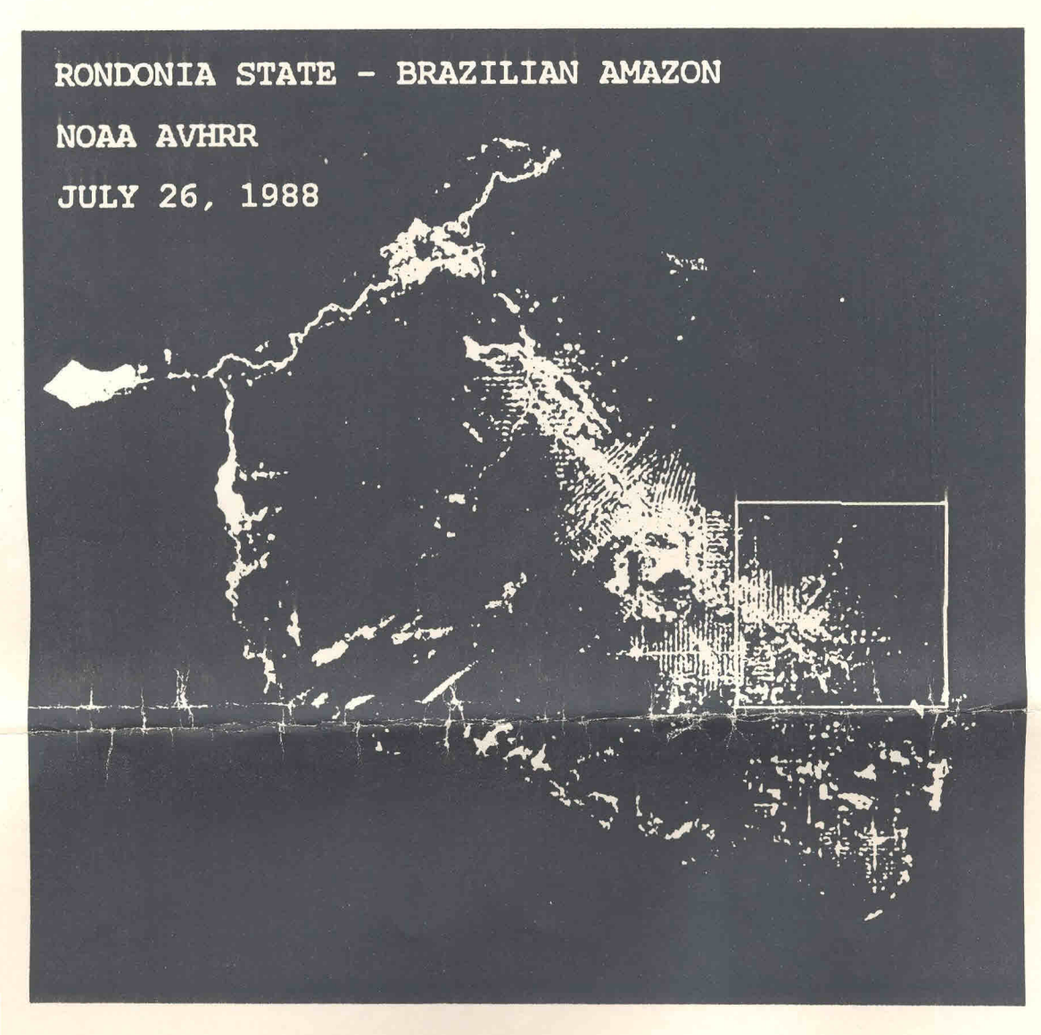
Figure 1. Colour composite of fraction images (Vegetation = Red, Soil = Green, and Shade = Blue) for NOAA AVHRR data acquired on 26 July 1988 over Rondonia State located in the Brazilian Amazon.

Instituto Nacional de Pesquisas Espaciais (INPE), Brazil—Universities Space Research Association/NASA-GSFC, Code 923 NASA/GSFC, Code 923, Greenbelt, Maryland, 20771, USA