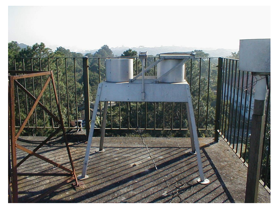
Figure 1b – Photo of wet-only collector (brand MTX - Italy) installed atop of the water tank at PEFI (Forti, 2000).

Each throughfall sample was a combination of 10 individual samples proportionally mixed to each sampled volume collected in a plot of 25 by 25 m. As described previously, the individual samples were collected in bulk collectors placed on 10 of the 36 spots of the plot, each separated from the others by 5 m. At each spot, a wooden stake (approximately 1.5 m high) was plunged into the soil and numbered from 1 to 36 before having a bulk rainfall collector fit to the free extremity. In order to maximize the probability of sampling the throughfall over the entire plot area, the 10 different positions were randomly moved at the end of each collection period. Their new positions were determined through the generation of 10 random numbers from 1 to 36. Figure 2 shows a CUNHA throughfall plot where there are two stakes. One of them has a collector fit to its upper end (foreground) and the other does not (background). For each rainfall or throughfall sample collected, the sampled volume was gravimetrically determined. As mentioned above, after determining the volume in each collector, throughfall samples were proportionally mixed to compose one single blended sample.