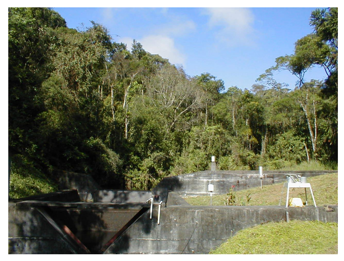
Figure 3b. Weir installed at the CUNHA stream B watershed (Forti, 2000).

In order to obtain the soluble fraction and sterilize the sample, all samples were vacuum filtered using pre-washed 0.22 \,\mu m pore membrane filters. After proper preservation (Apello & Postma, 1996), all samples were stored in a refrigerator at 4° C until the analysis.