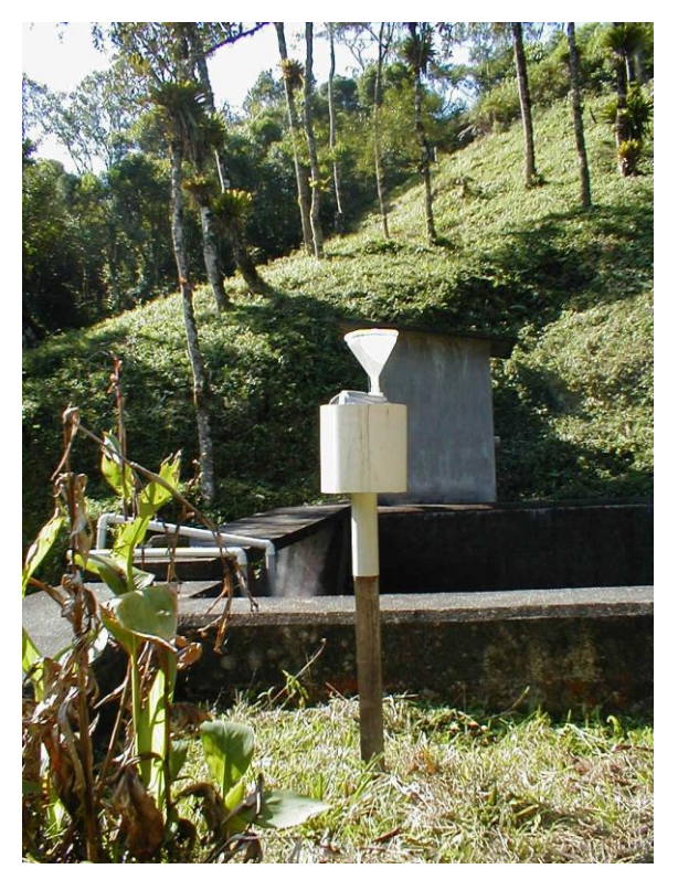
Figure 1a – Picture of the bulk collector installed next to the catchment B weir at CUNHA (Forti, 2000).

If enough rain had fallen, the sampling bottles of rain and throughfall water would be collected every 7 days, constituting accumulated samples for the period. In order to minimize dry deposition, all sampling bottles would be replaced with fresh ones after 15 days in case there had been no rain. At both sites, samples were collected in bulk samplers (5 L polyethylene bottle attached to a funnel with a diameter of 167.45 cm<sup>2</sup> protected with a nylon screen), as well as in wet-only samplers (Figures 1a and 1b).