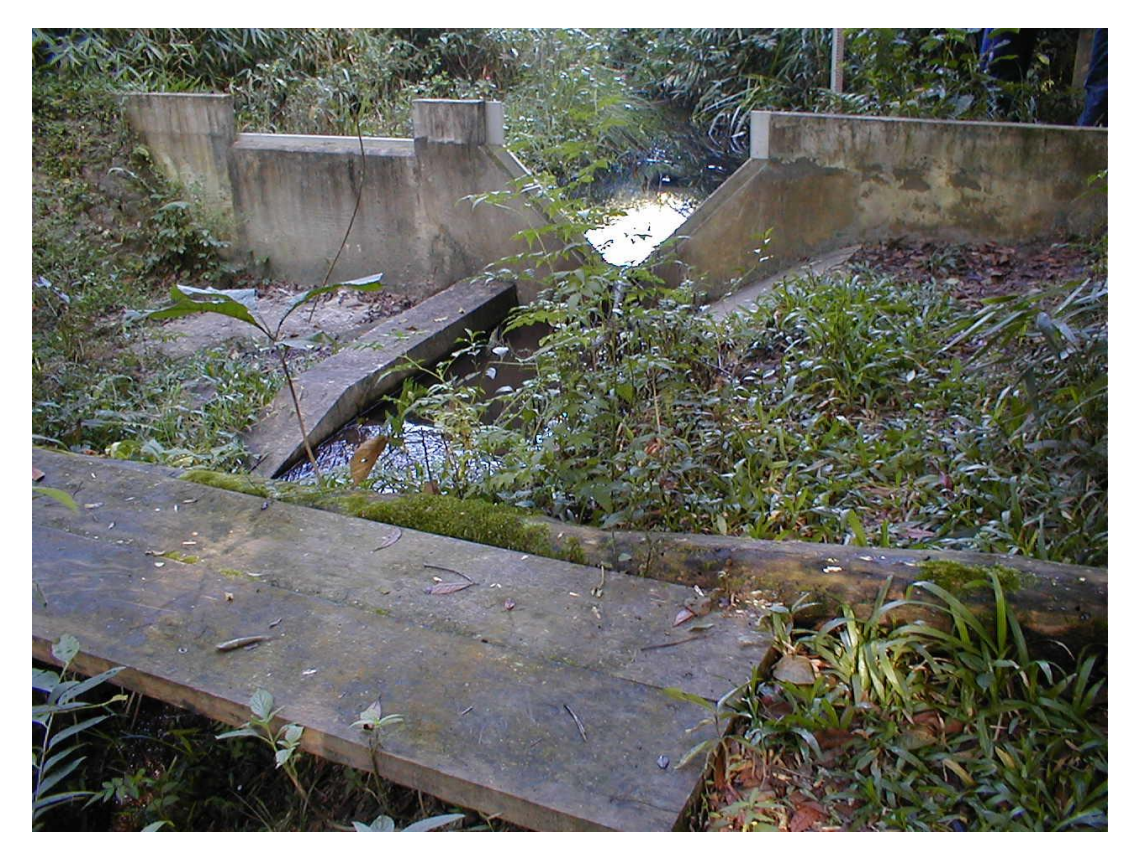
Figure 3a. Weir installed at the PEFI stream basin (Forti, 2000).

The stream water samples were collected every 7 days, about 10 m upstream from the backwater area of the weir. That was done by plunging the bottle into the middle of the stream, rinsing it at full volume and filling it up again to obtain the sample. For the PEFI, the scale was read simultaneously with the stream sampling. Figures 3a and 3b show pictures of the PEFI and CUNHA weirs, respectively.