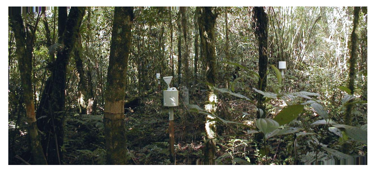
Figure 2 – Photo of the throughfall plot installed at CUNHA (Forti, 2000).

The stream water samples were collected every 7 days, about 10 m upstream from the backwater area of the weir. That was done by plunging the bottle into the middle of the stream, rinsing it at full volume and filling it up again to obtain the sample. For the PEFI, the scale was read simultaneously with the stream sampling. Figures 3a and 3b show pictures of the PEFI and CUNHA weirs, respectively.